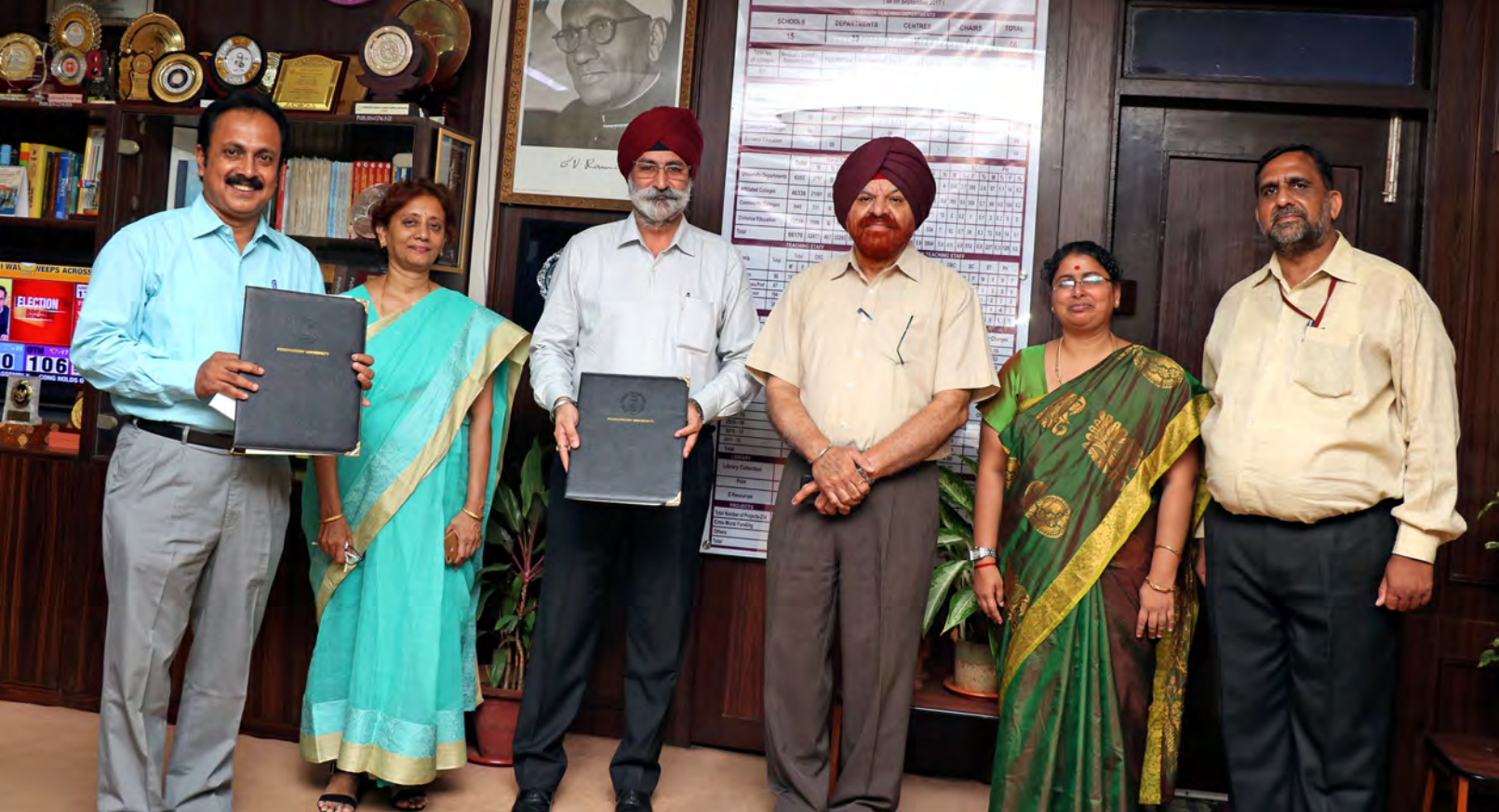
Signing of MoU with Pondicherry University