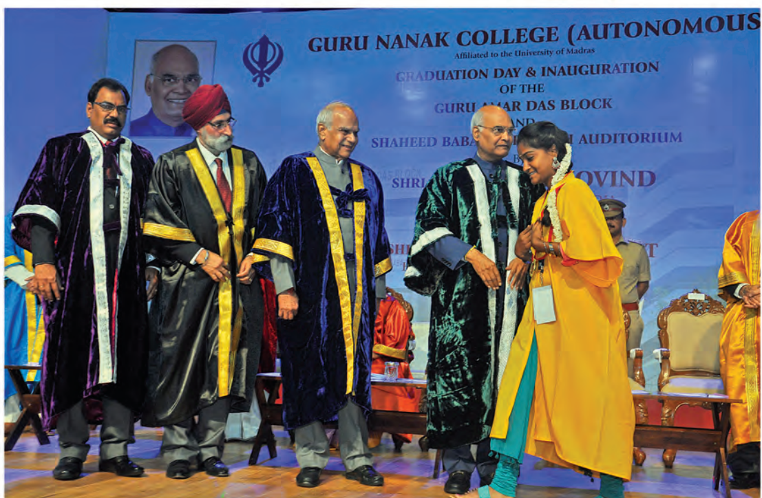
Convocation at Guru Nanak College, Presided over by Hon'ble President of India Shri. Ram Nath Kovind Ji