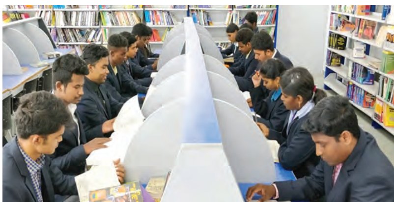
Library For Management Programme