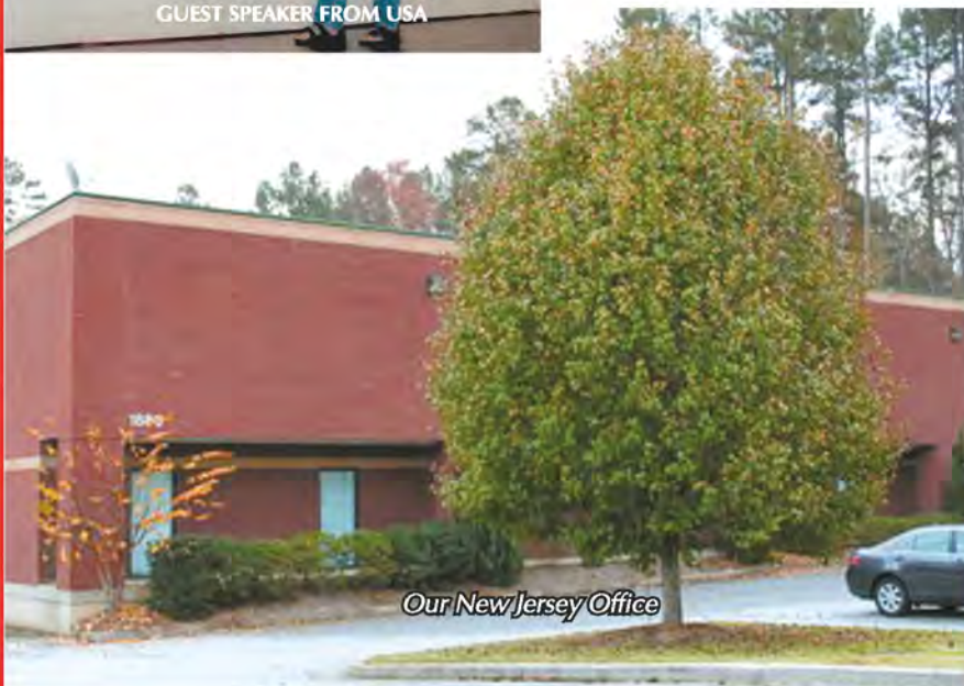
Our New Jersey Office