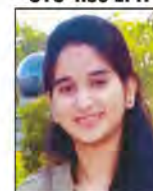
GAREEMA B.TECH. (CS)-2021 INFOSYS SYSTEM CTC 3.60 LPA