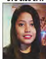
GRACY MCA INFOSYS LTD. CTC 3.50 LPA