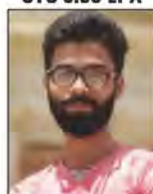
SHUBHAM MBA SITUS AMC CTC 5.00 LPA