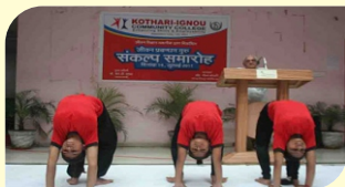
YOGA & MEDITATION HALL