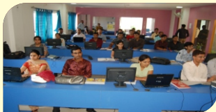
ONLINE TEST FACILITIES