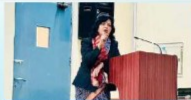
Guest Lecture on Sexual Harassment of Women at Workplace