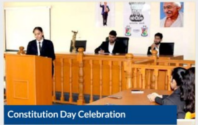
Constitution Day Celebration