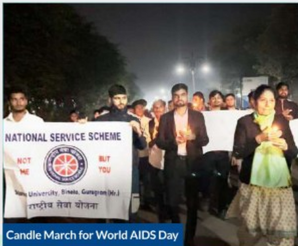
Candle March for World AIDS Day