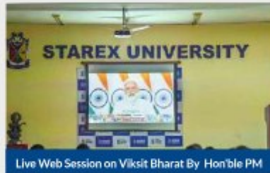
Live Web Session on Viksit Bharat By Hon'ble PM